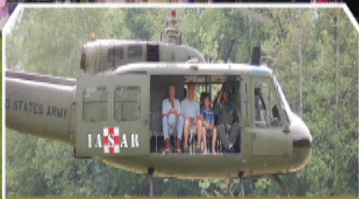
Huey Helicopter Rides from 12:00 to 4:00pm